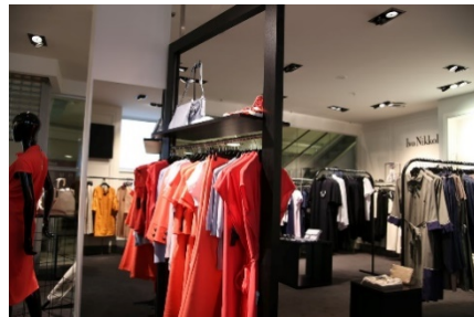
Small local store