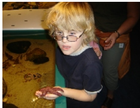
Check out this starfish!